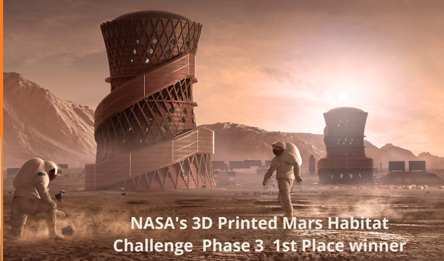
NASA's 3D Printed Mars Habitat Challenge Phase 3 1st Place winner